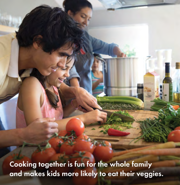
Cooking together is fun for the whole family and makes kids more likely to eat their veggies.